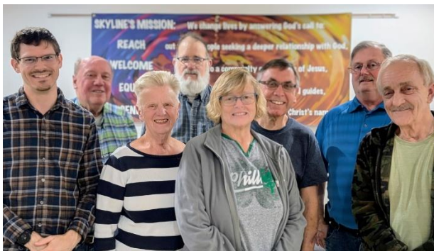
Disciple Bible Study